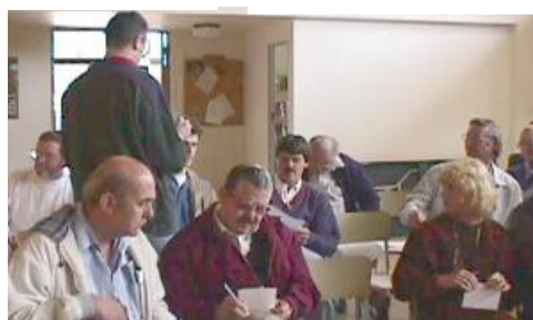
Voting on the club name change.