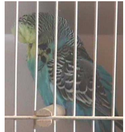
Yellowface Skyblue Nel Brother Stud