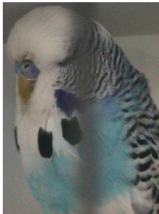
Left: Dominant Pied CC - Pieter vd Linde