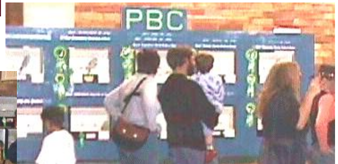
The Major awards stand with visitors