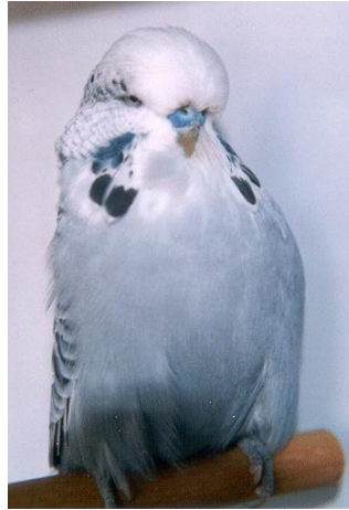
Best Bird and Best Champion on Show H Artus