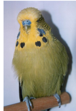
Best Novice on Show Aratinga Aviaries