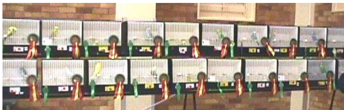
All the Challenge Certificate Winners