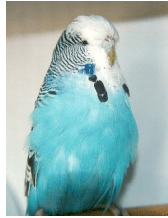
Best Opposite Sex on Show F Sherman