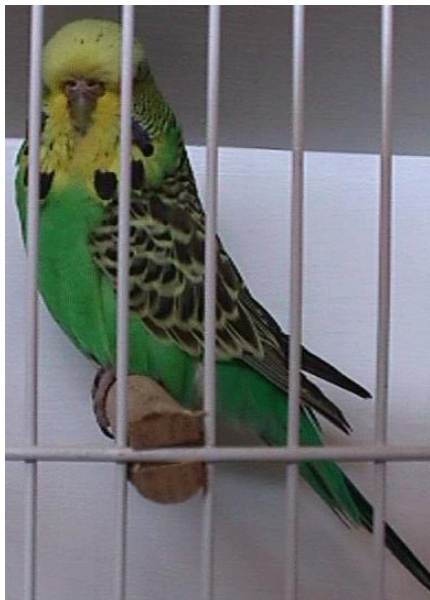
Top Left: Best Bird on Show - Nel Brothers Stud Top Right: Best Opposite Sex - Andre Erasmus