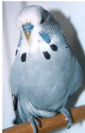
Best Intermediate on Show CM Kenton