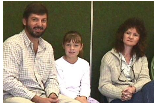
The van Staden family