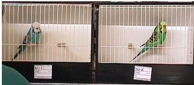
Top Left: Best Bird - Nel Brothers Stud Top Right: Best Opposite Sex - Andre Erasmus