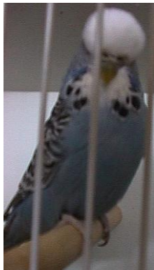
Best Intermediate and Best Opposite Sex on Show - Nel Brothers Stud