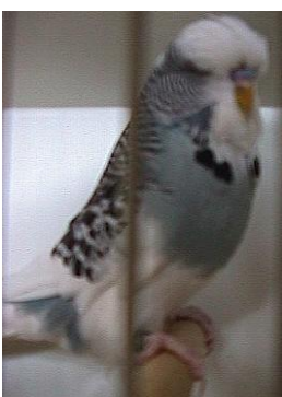
Best Champion and Best on Show - Molkentin Stud