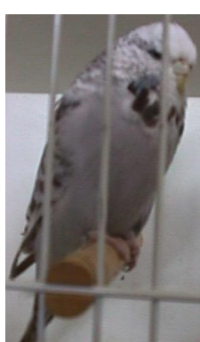
Best Beginner on Show - Kobus Hechter