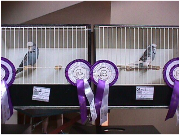
Best Opposite sex - Nel Brothers Stud and Best Bird - Molkentin Stud