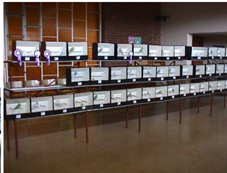
Mini Show exhibits