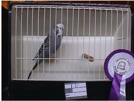
Best Beginner on Show - Kobus Hechter