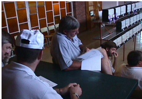
Stewarding being discussed.