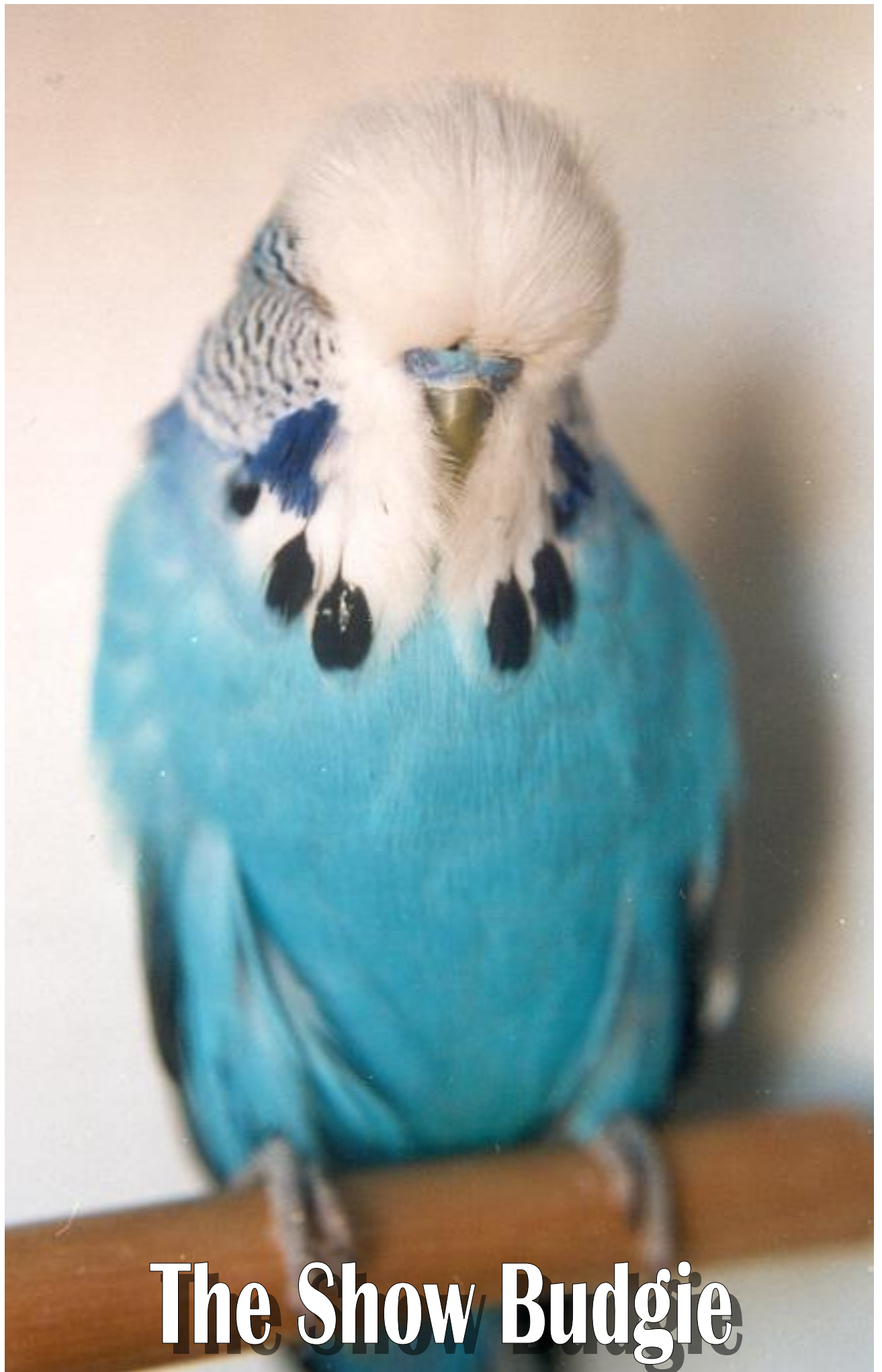
The Show Budgie