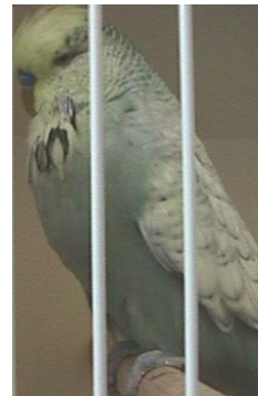
The type of Spangle we are all striving to breed. Note the spots