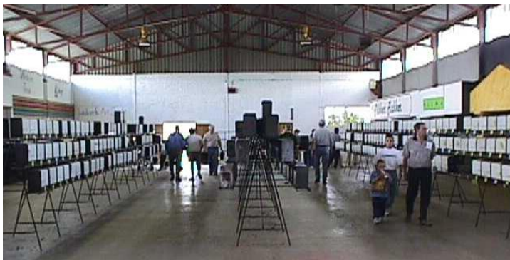
The show hall