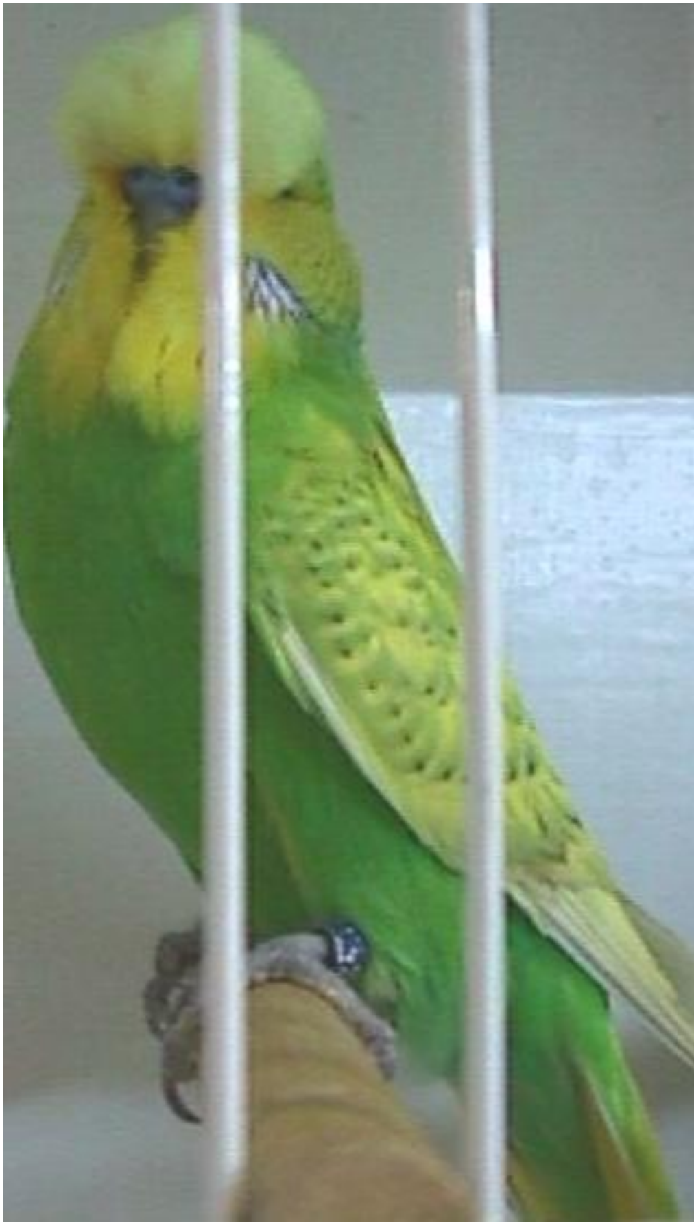
The Show Budgie