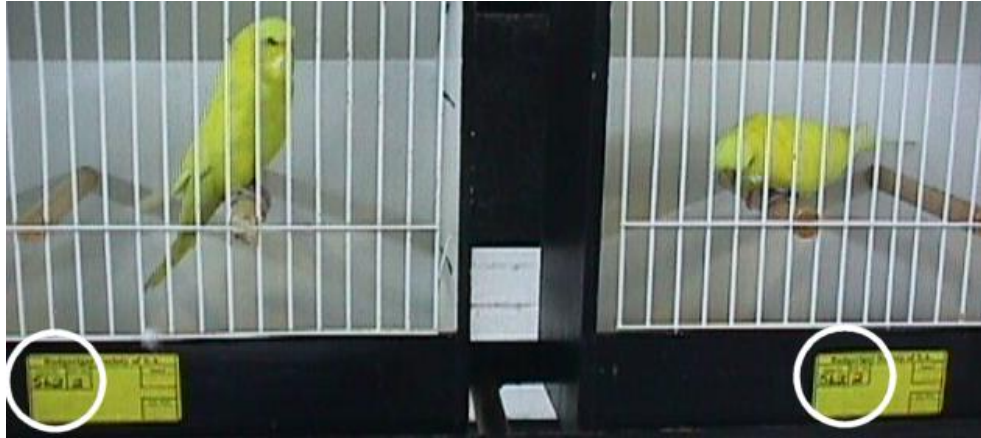
Exhibits 562/2. Both exhibits had the same exhibit numbers.