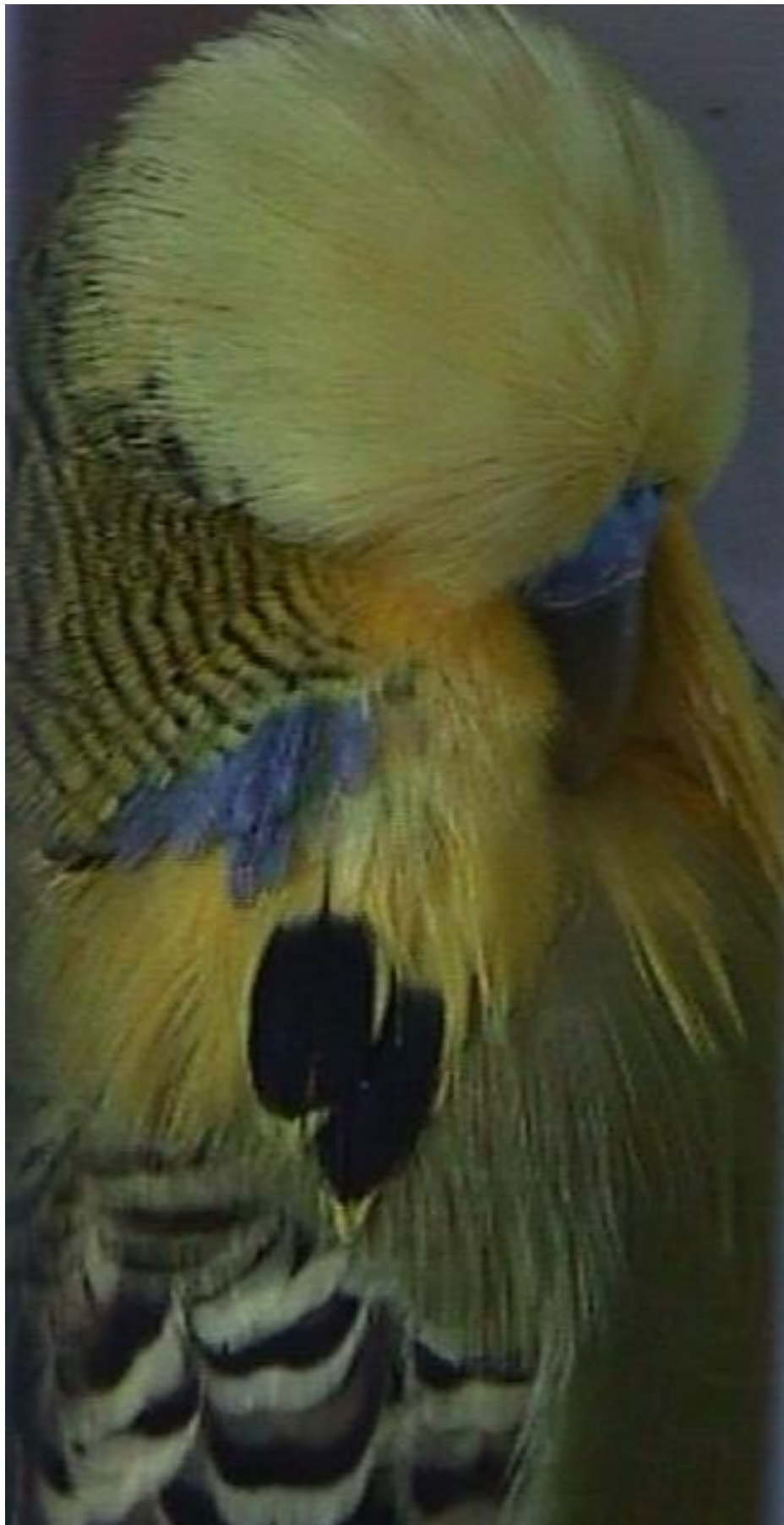
The Show Budgie