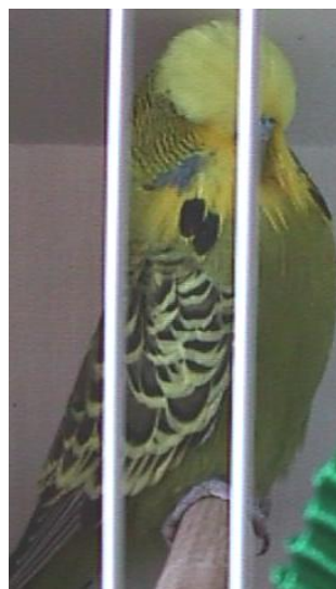
Top : Best Bird on Show - George Sutton