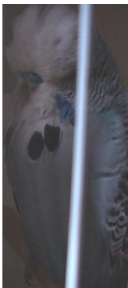
Top: Best Intermediate, Craig Kenton