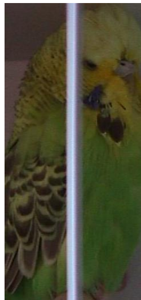
Top : Best Beginner, JJ Erwee