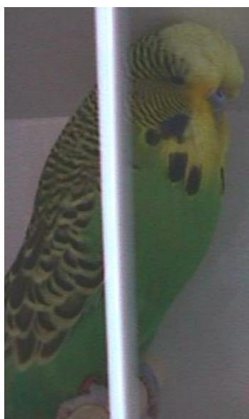
Top: Best Novice, Hey Aviaries