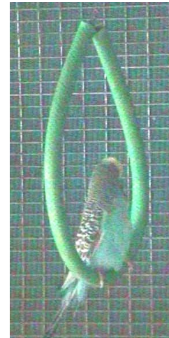
Top: Swings provided in the flights for the birds.