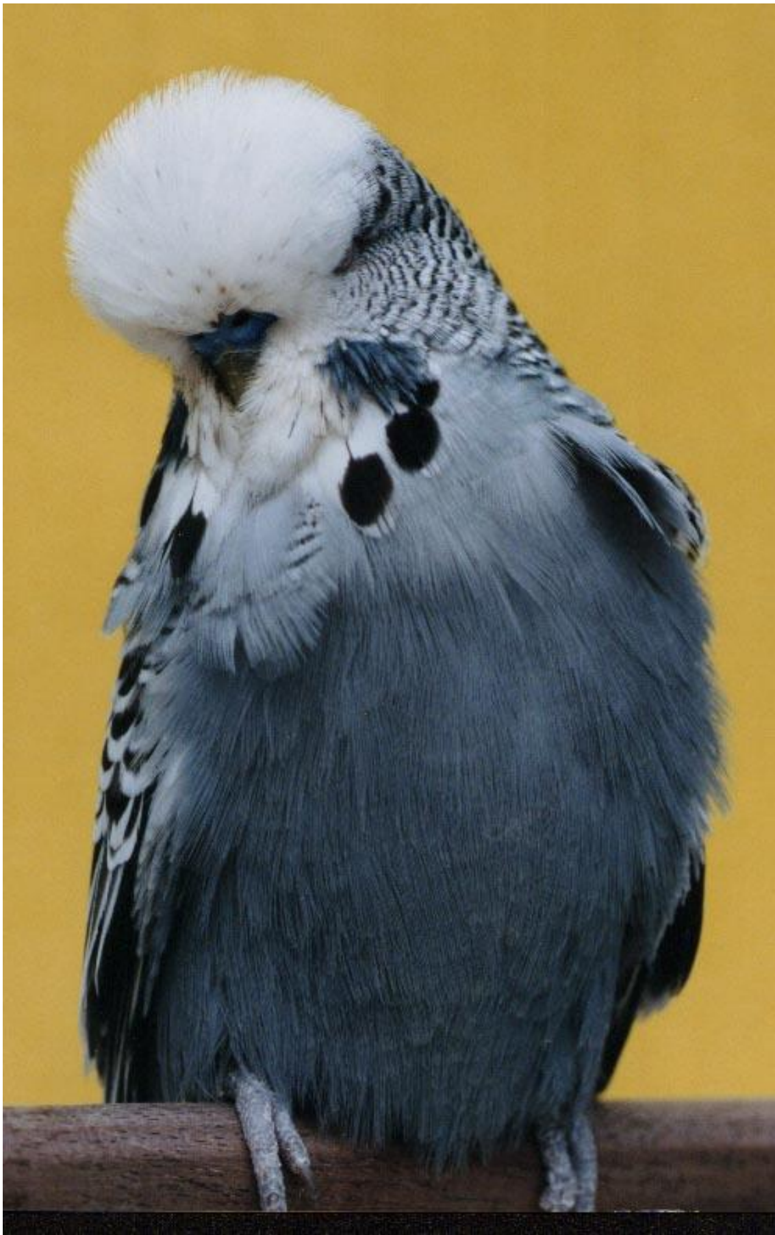
The Show Budgie