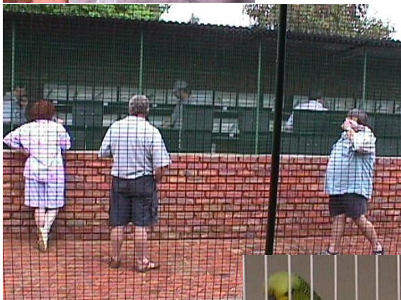
Left: The layout at Lood and Leon's place.