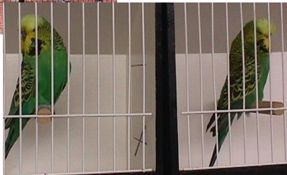
Right: The first and second placed birds bred by the Nel Brothers Stud. Both Dark Green cocks. 100 Birds were benched on the day.