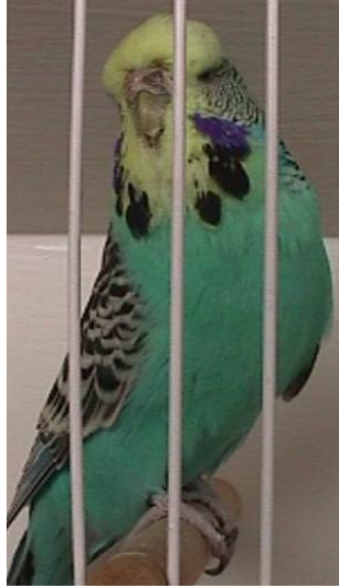
Best Opposite Sex on Show and Best Opposite Sex Intermediate on Show Nel Brothers Stud