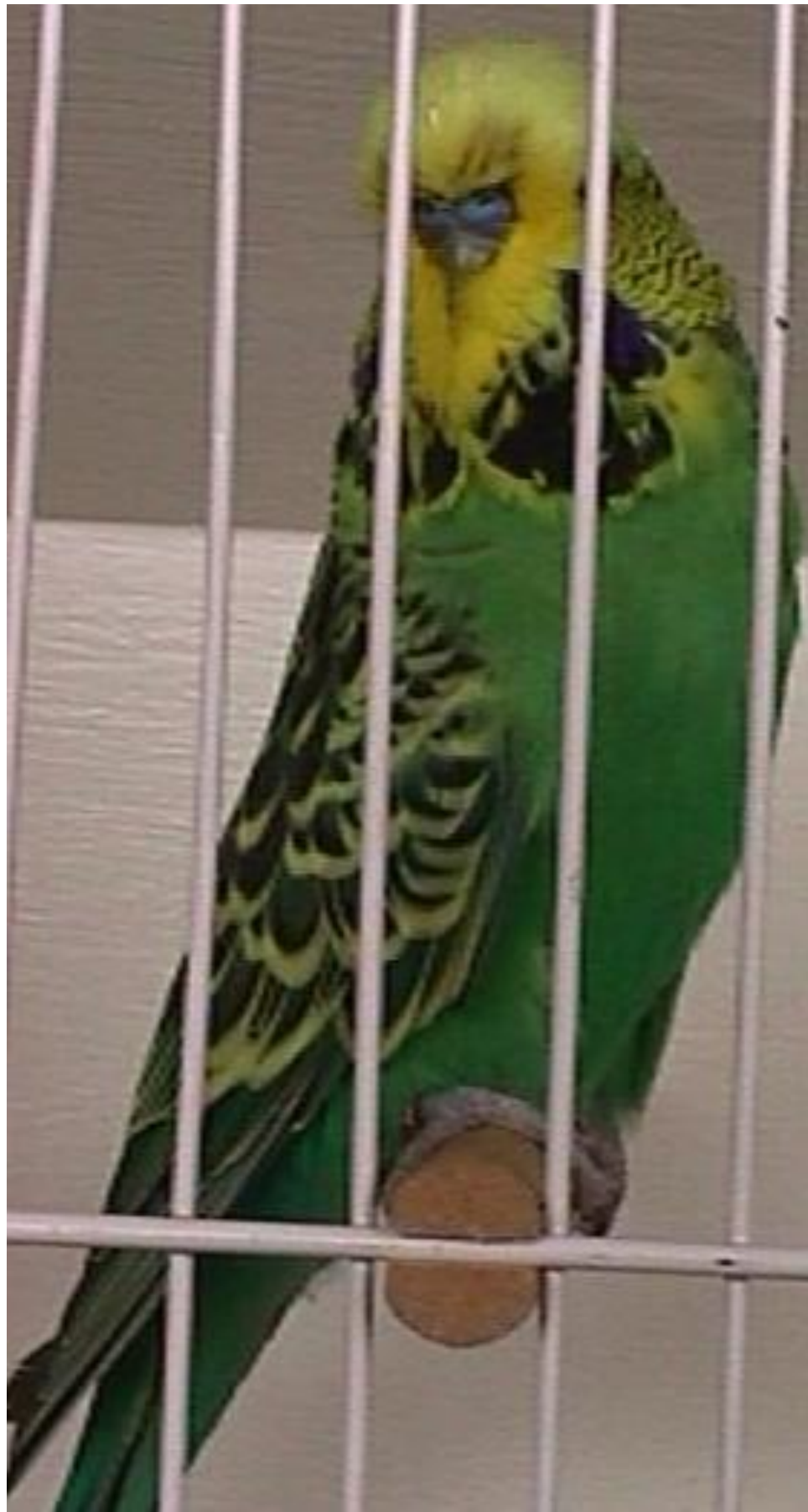
The Show Budgie