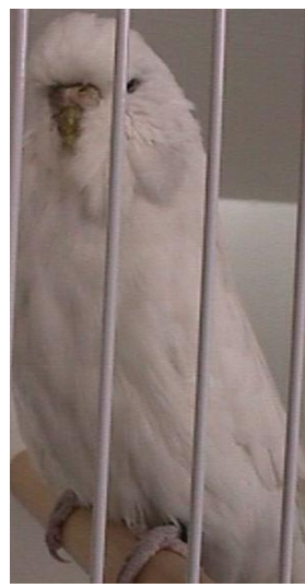
Best Beginner on Show Jacobs & Uys