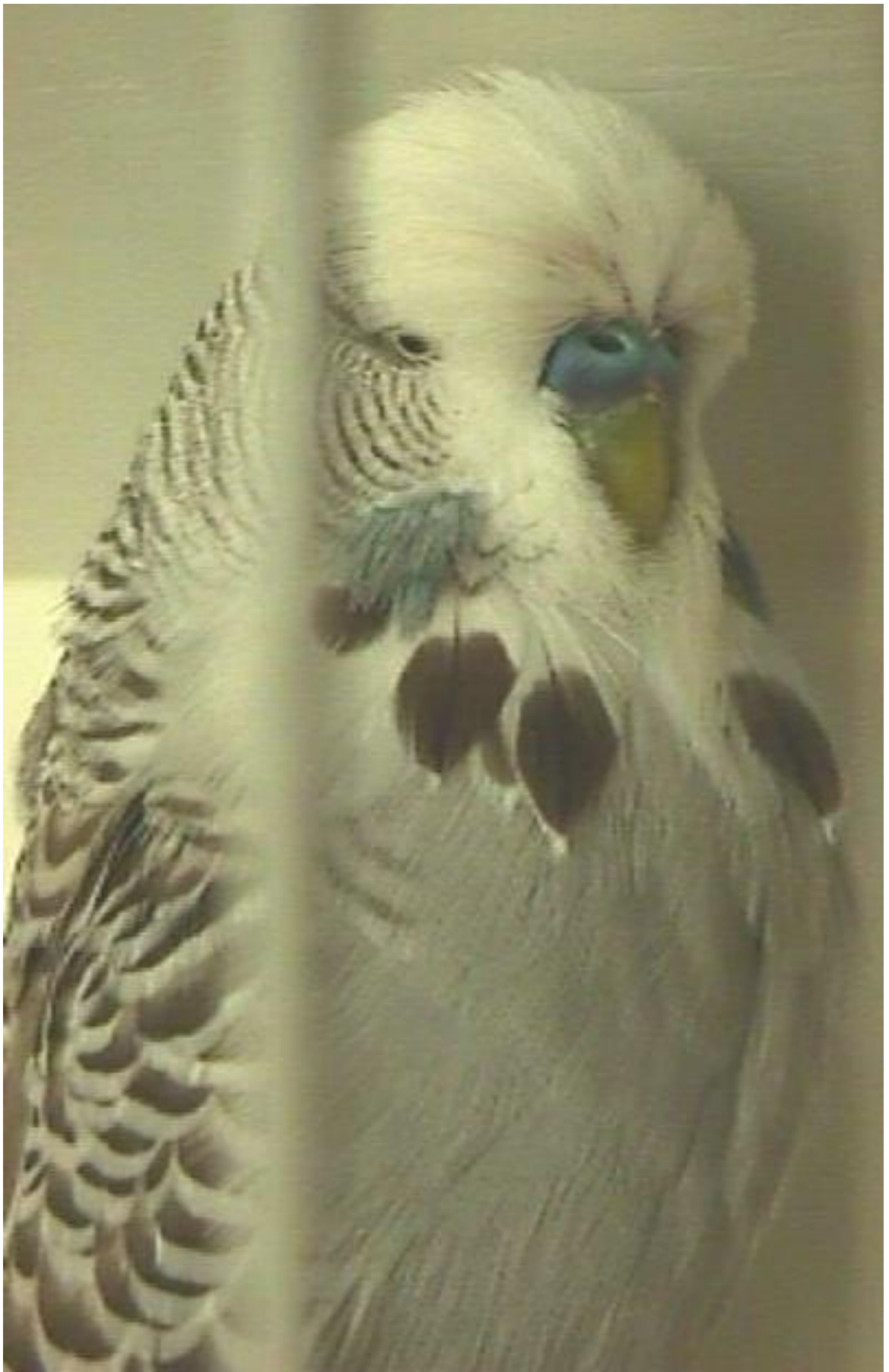
The Show Budgie