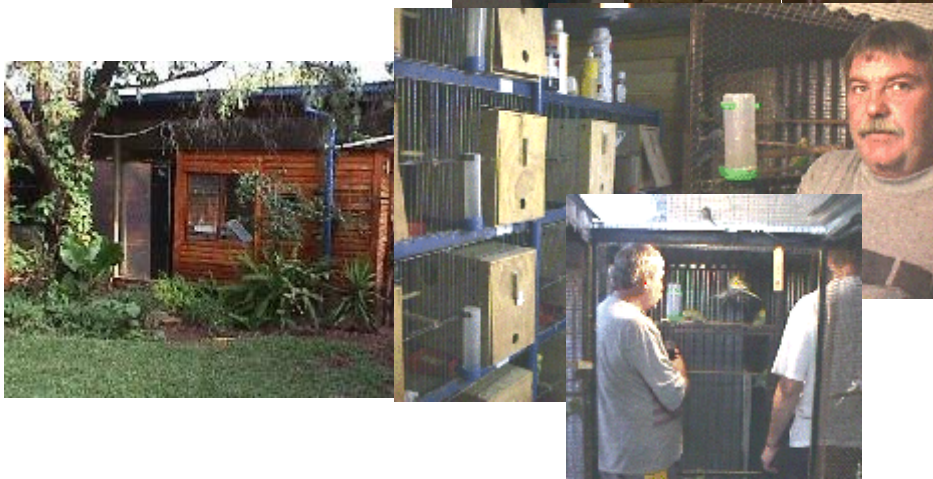
Top (L to Right) Gert's aviary, Breeding room, Gert in the breeding room.