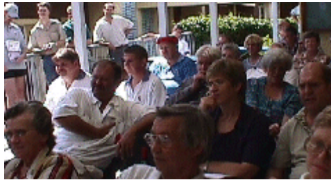
Exhibitors at the prize giving