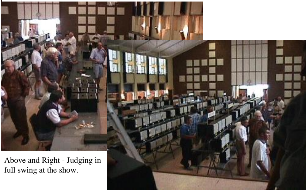
Above and Right - Judging in full swing at the show.