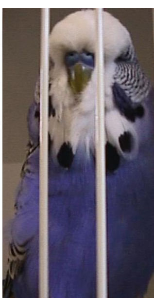
Top: Best Violet in Show -