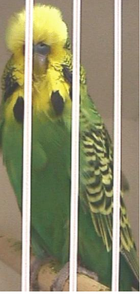
Top: Best Dark Green in Show -