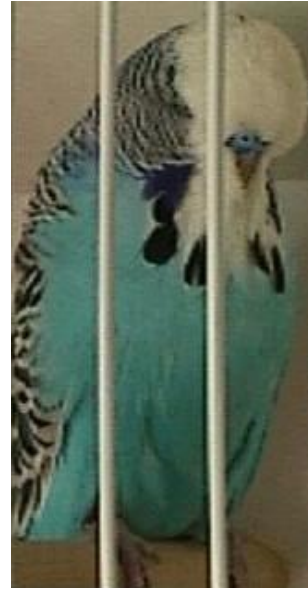
Top: Best Bird in Show - Deon Davie