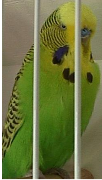
Top : Best Novice in Show - Jacobs & Uys