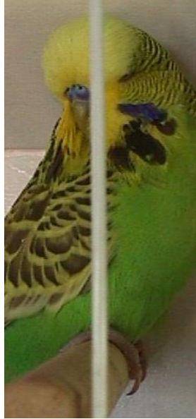
Top: Best Beginner in Show - Giel Calitz