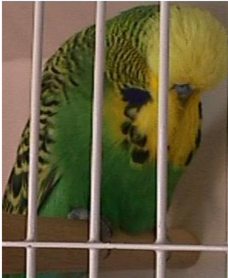
Above - Nel Brothers Stud, Best Intermediate in Show