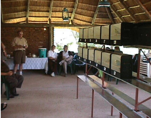
Top: The Show venue.