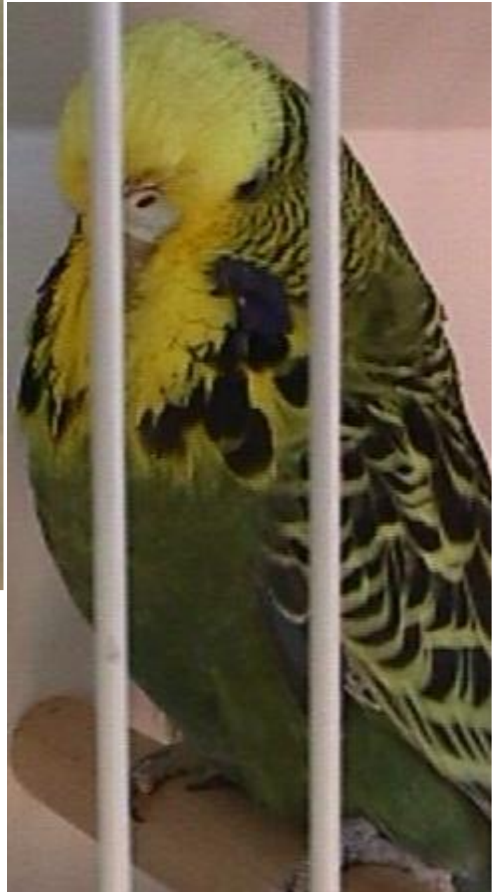
The Show Budgie