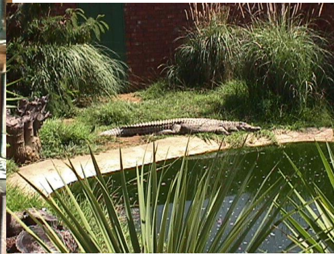
Top : Crocodiles in one of the enclosures. Left: Gert and Giel looking at the birds after judging.