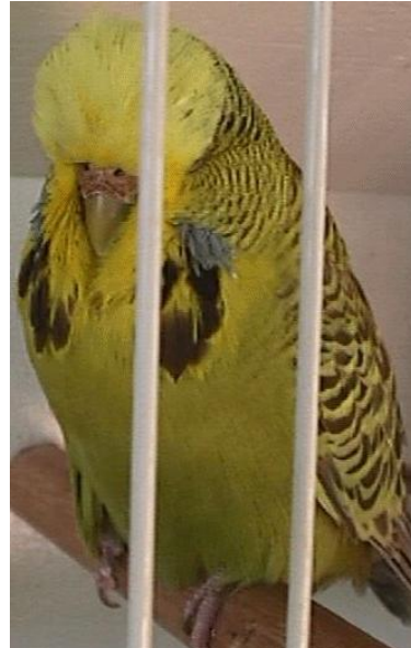
Above - Giel Calitz, Best Beginner Opposite Sex in Show.