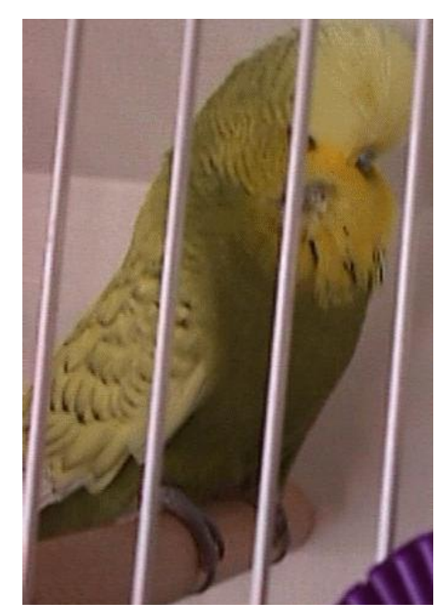
Above - Nel Brothers Stud - Best Intermediate in Show.