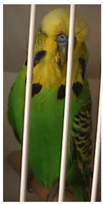
Above - Molkentin Stud - Best Bird and Best Champion in Show

Best Beginner Opposite Sex in Show - Giel Calitz