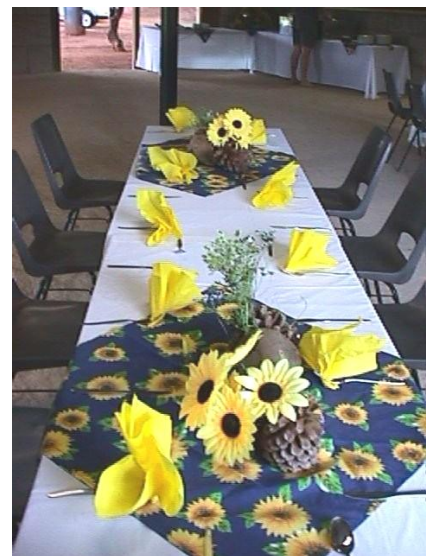
The tables at the year-end function.