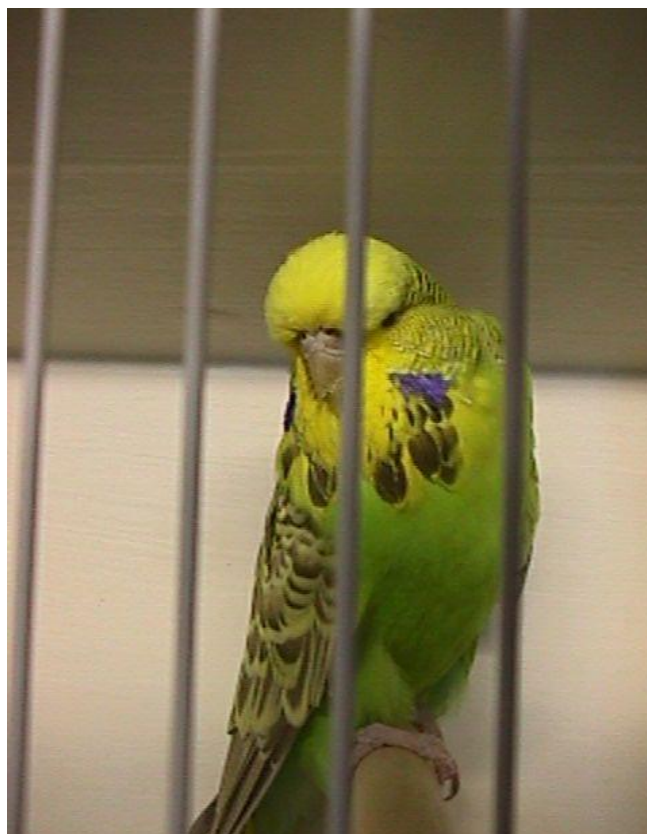
Top: Best Opposite sex on show – Corrie van Staden

The next show will take place on 12 April. Check your year program for details. ♦