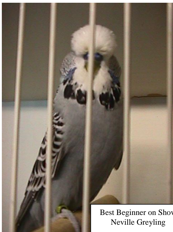
Best Beginner on Show Neville Greyling