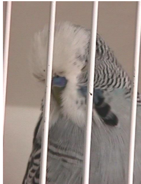
Top: Best Derby on Show – Nel Brothers Stud

For the 2003 Derby competition ring numbers 1 to 10 will be used as in previous year. ♦