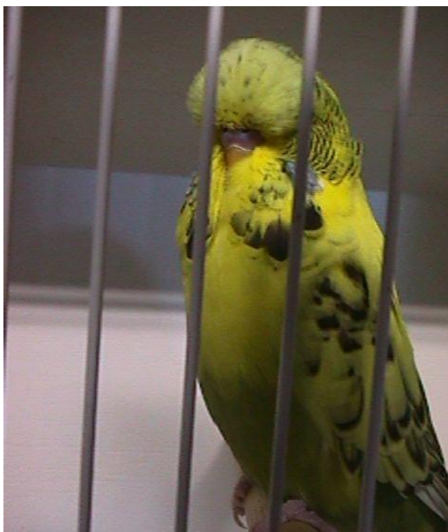
Top: Best Intermediate on show – Pieter vd Linde