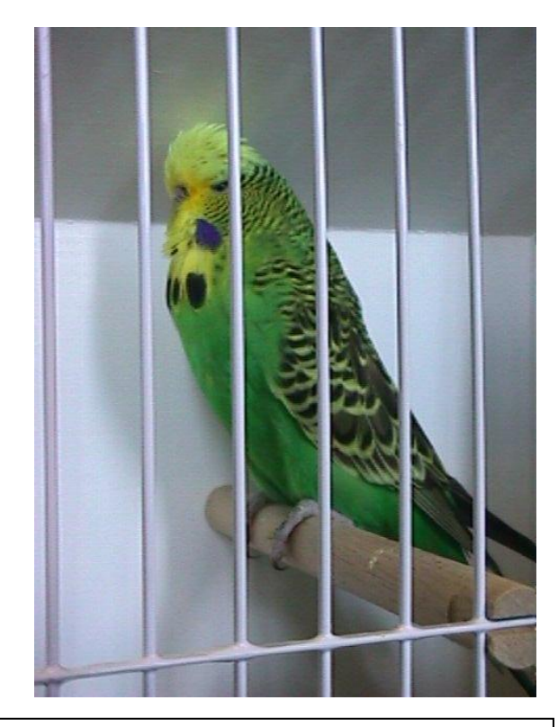
Top Left: Best Opposite Sex on Show - Molkentin Stud. Top Right: Best Intermediate on Show -RDM Aviaries