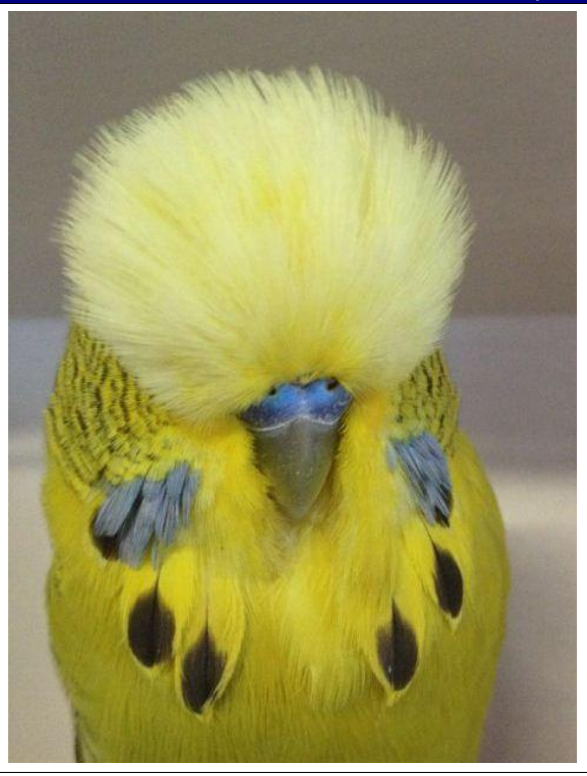
Best Opposite Sex on Show - Eastern Cape 2014 - Deon Davie