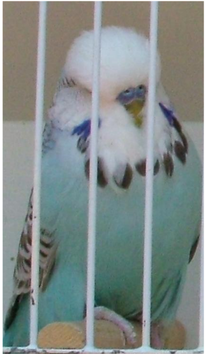
Right Best Opposite Sex on Show and Best Novice on Show Koos du Preez