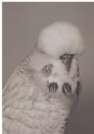
Nel Brother Stud, Best Any Age on Show, Spangle Blue