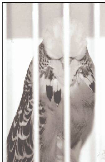
Above Left: Thistle Aviaries Best Bird on Show. (Cobolt Cock)