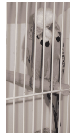
De Beer Partnership, Best Bird on Show