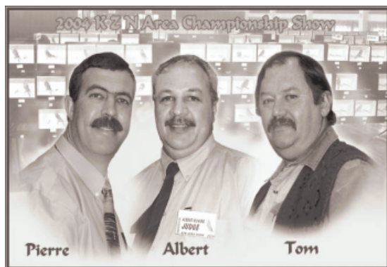
Kwazulu Natal Championship Show Judges.