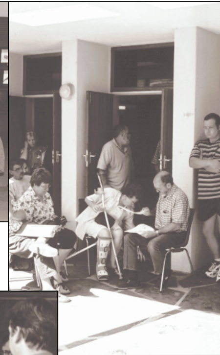
Right: Members gather for the prize giving.