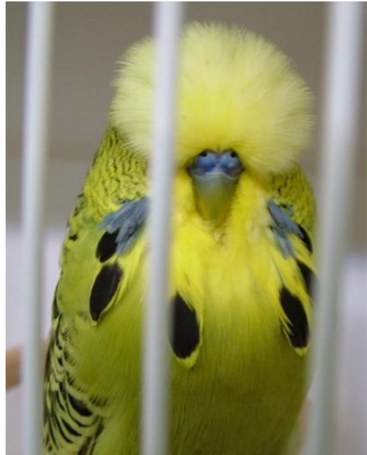
Above: Best Bird on Show – Molkentin Stud