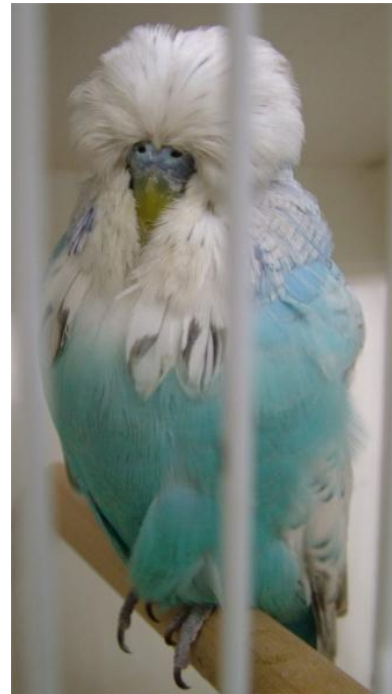
Above: Best Novice on Show – Japie & Noelë