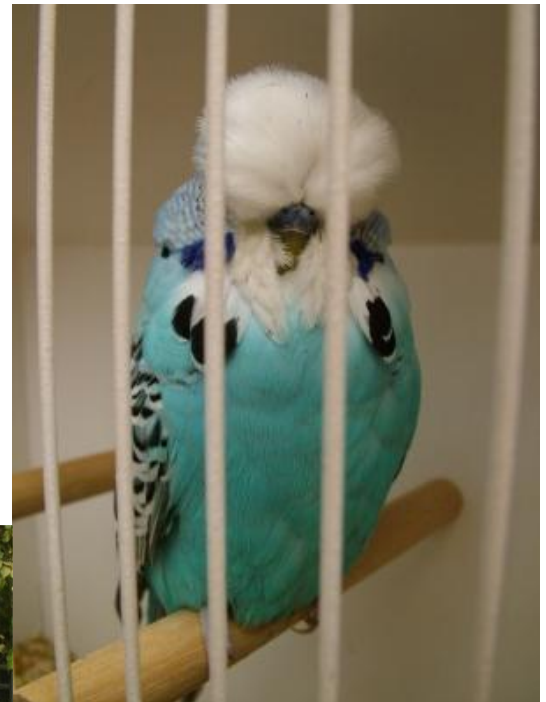
Above: Best Opposite Sex on Show Pierre Swart