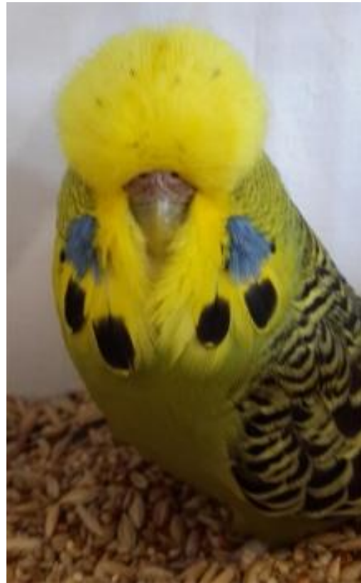
Above: Best Opposite Sex on Show – Glen Furniss