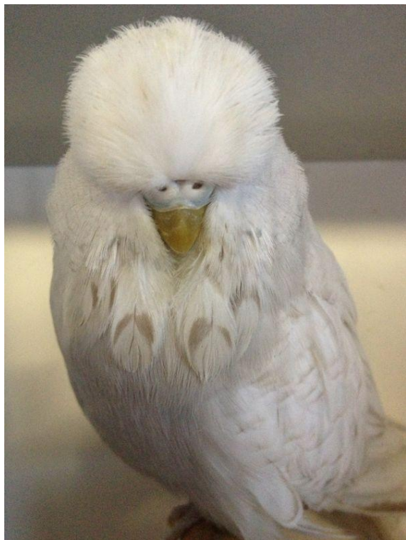
Above: Best Bird on Show at the 2014 Eastern Cape Show Tony Slight