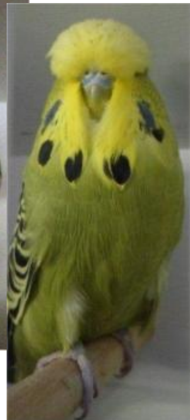
Right: Best Opposite Sex on Show – Creigh Kenton