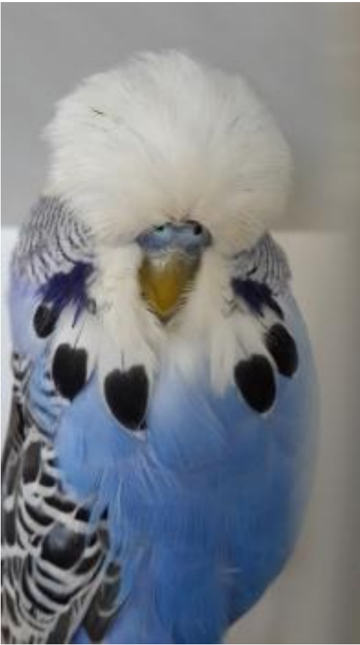
Above: Best Intermediate on Show – Japie and Noelë