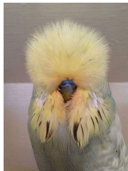
Best Bird on Show – Albert van Wyk

http://www.tripadvisor.com/Attractions-g312564-Activities-Bloemfontein_Free_State.html