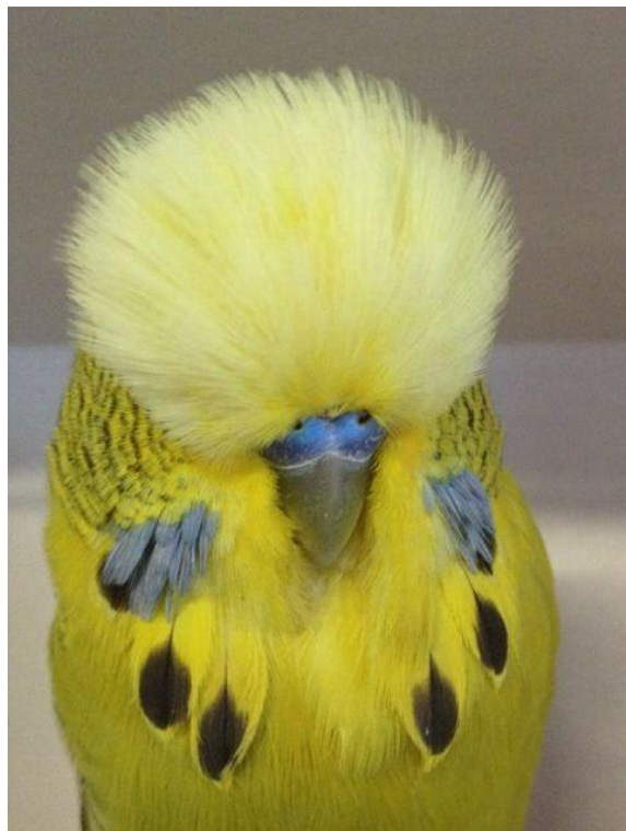
Above: Best Opposite Sex on Show at the 2014 Eastern Cape Show Deon Davie