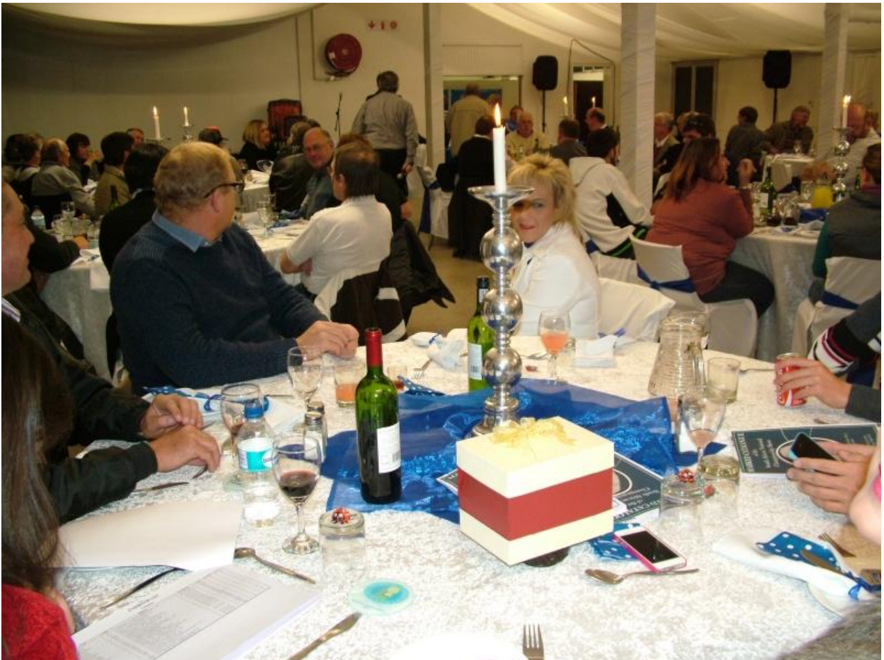
Above: Members at the SA National 2013 Gala evening