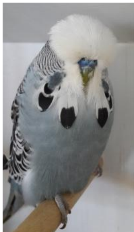
Right Best Grey Challenge Certificate – Creigh Kenton