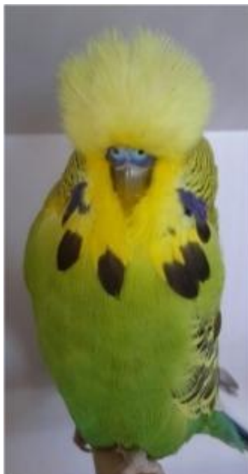
Left Best Cin Green Series - Japie & Noelë